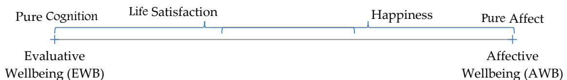
Figure 1: Wellbeing—Life Satisfaction and Happiness on the EWB—AWB

EWB and AWB both emanate from two primary categories of sources: livability and lifeability . Livability denotes environmental, societal factors, in which a person finds himself or herself, and lifeability describes the internal, personal dynamics that enable this person to benefit from his or her environment.